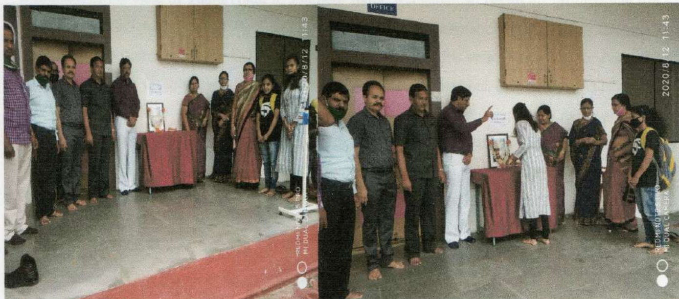
Floral honour to Idol of Dr. S. R. Ranganthan

A library is a place where students, staff, and often, parents of a public or private school or college and educational institutions have access to a variety of resources. The goal of the library media center is to ensure that all members of community have equitable access "to books and reading, to information, and to information technology. A library media center uses all types of media... are automated, and utilize the Internet [as well as books] for information gathering. Libraries are distinct from public libraries because they serve as learner-oriented laboratories which support, extend, and individualize the school's curriculum. A library serves as the center and coordinating agency for all material used in the college.